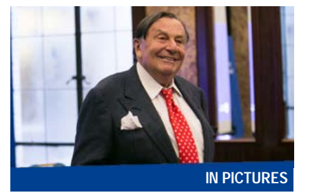
Special alumni event at Australia House in London more