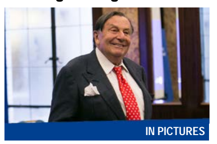
Special alumni event at Australia House in London more