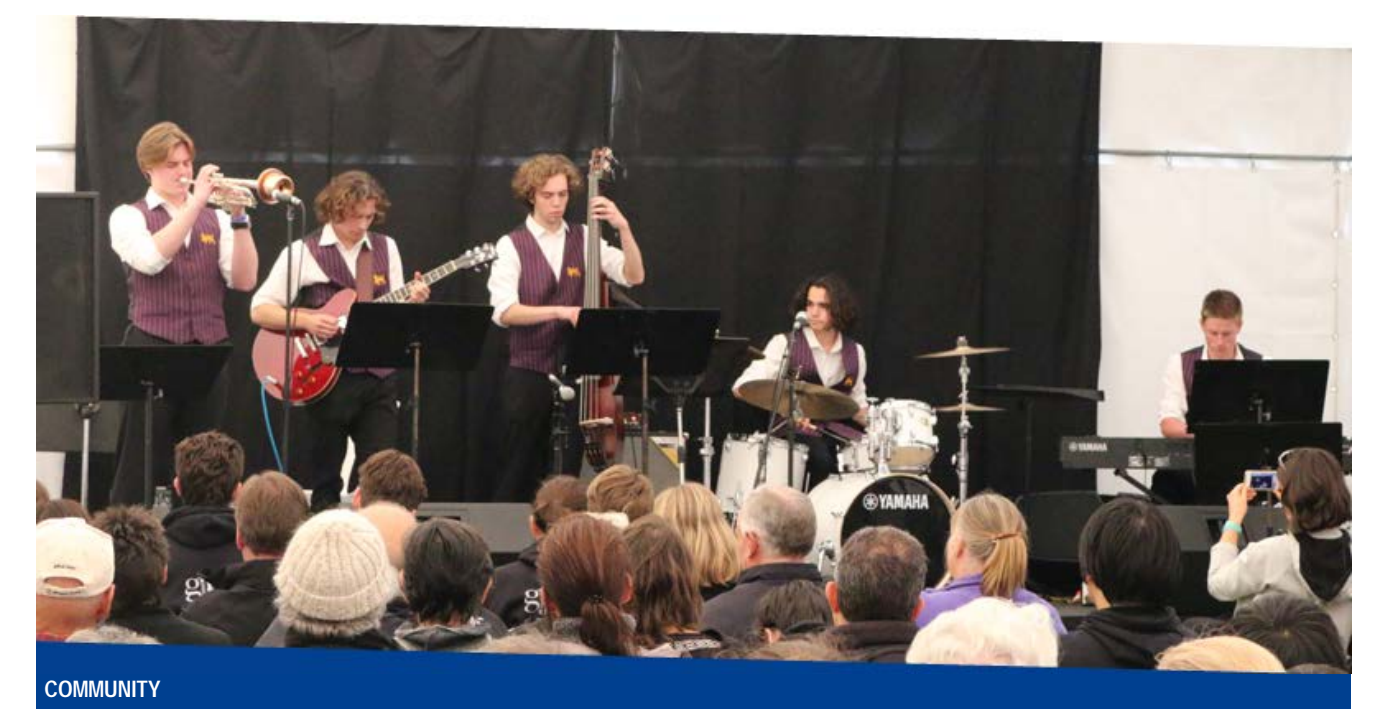
Students performing in a jazz combo at the Apple Farm marquee.