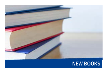
The latest books from UniSA researchers more