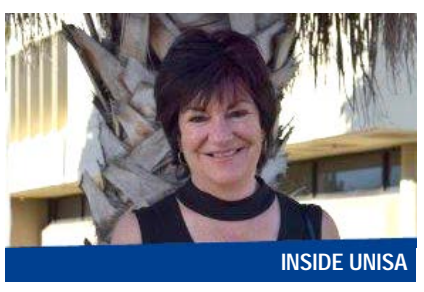
Lisa shines as an example of excellence more

The latest achievements and announcements more