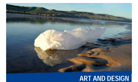
Unmaking waste through social enterprise and behavioural change more