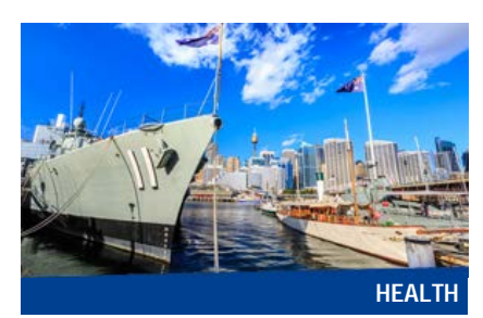
3D anthropometry experts help steer the Navy of the future more