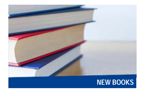
The latest books from UniSA researchers more