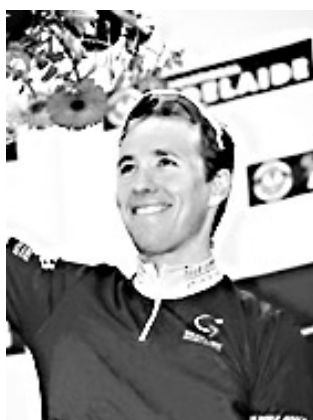
Sydney 2000 gold medallist Bret Aitken

The Tour Down Under racing through the streets of Hahndorf in January