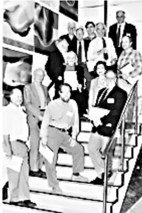
Original staff members of the Sir Charles Todd Building who attended the 25th anniversary ceremony

Twenty-five years of the Sir Charles Todd Building were celebrated at Mawson Lakes in November. The building was opened in October 1975 by the then Governor of South Australia, Sir Mark Oliphant.