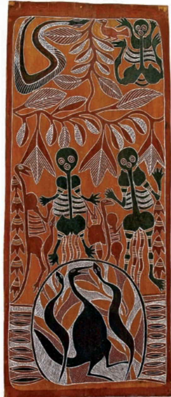
From left: Thaganmu Arnold WATT, Mornington Island Dreaming , 1973, © estate of the artist; Murtitjpu MUNUNGGURR, Disposal of bodies after death , c. 1968, © estate of the artist