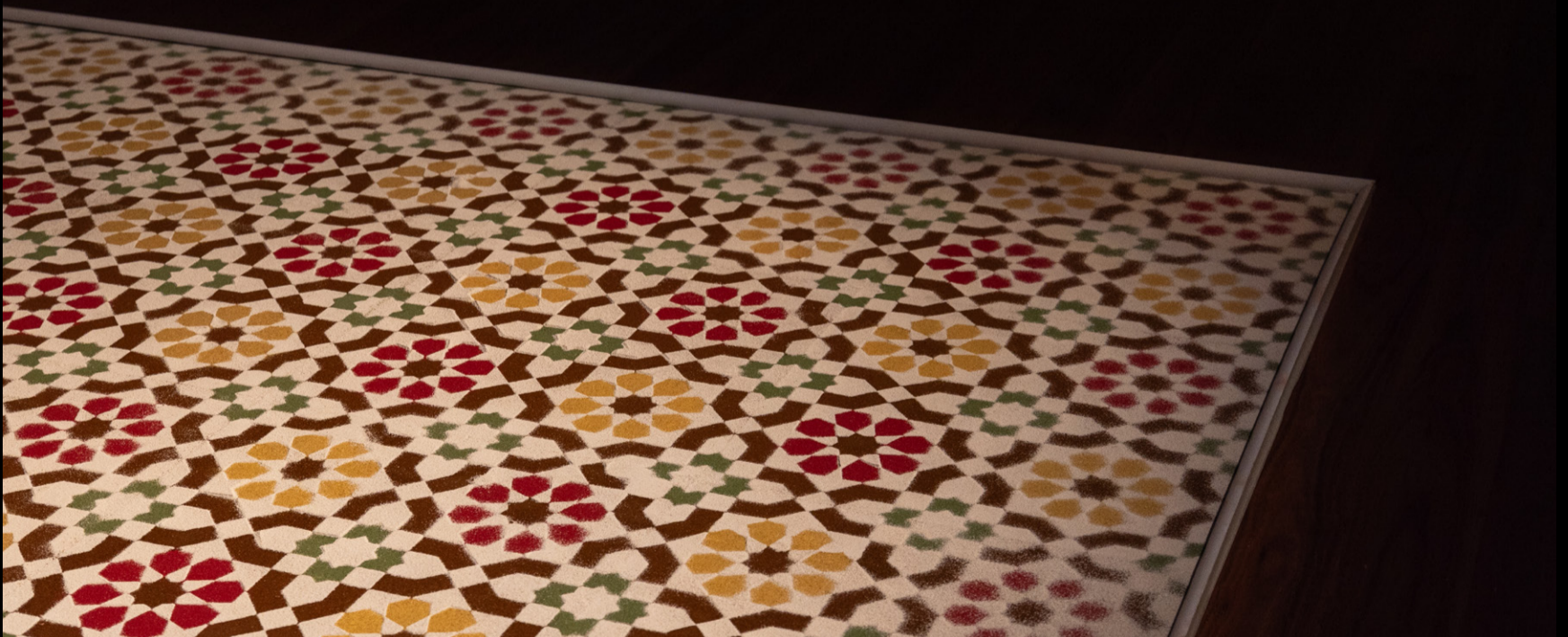
Dana AWARTANI, I Went Away and Forgot You. A While Ago I Remembered. I Remembered I'd Forgotten You. I Was Dreaming , 2017, installation view, Samstag Museum of Art, 2024 Adelaide Festival.