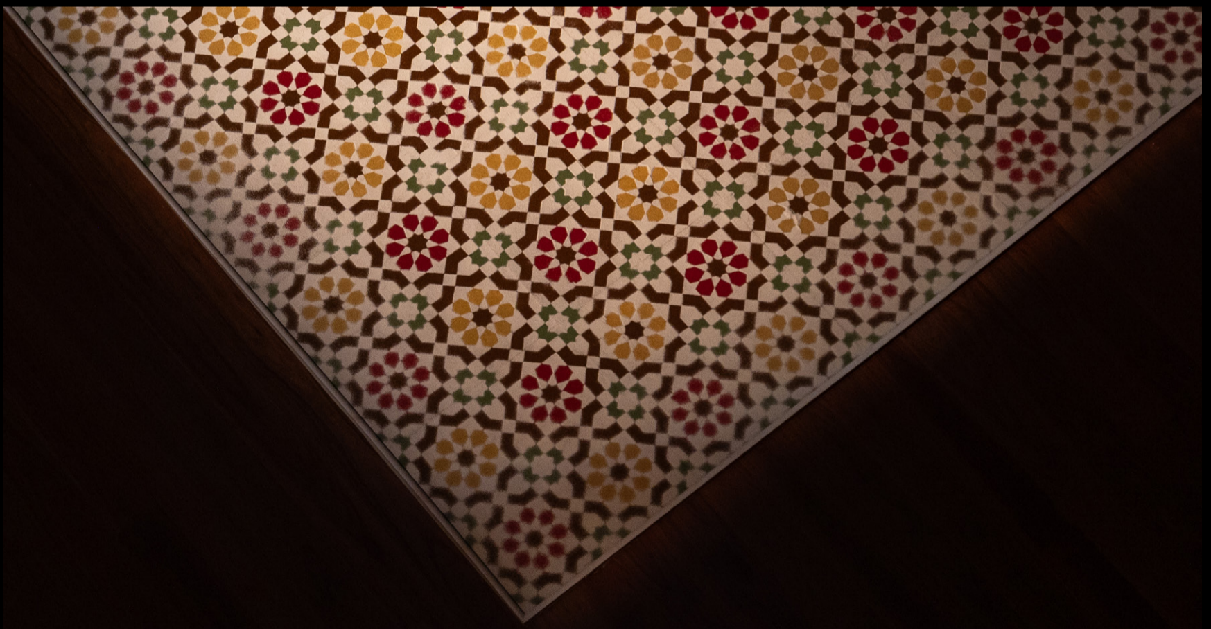
Dana AWARTANI, I Went Away and Forgot You. A While Ago I Remembered. I Remembered I'd Forgotten You. I Was Dreaming , 2017, installation view, Samstag Museum of Art, 2024 Adelaide Festival.