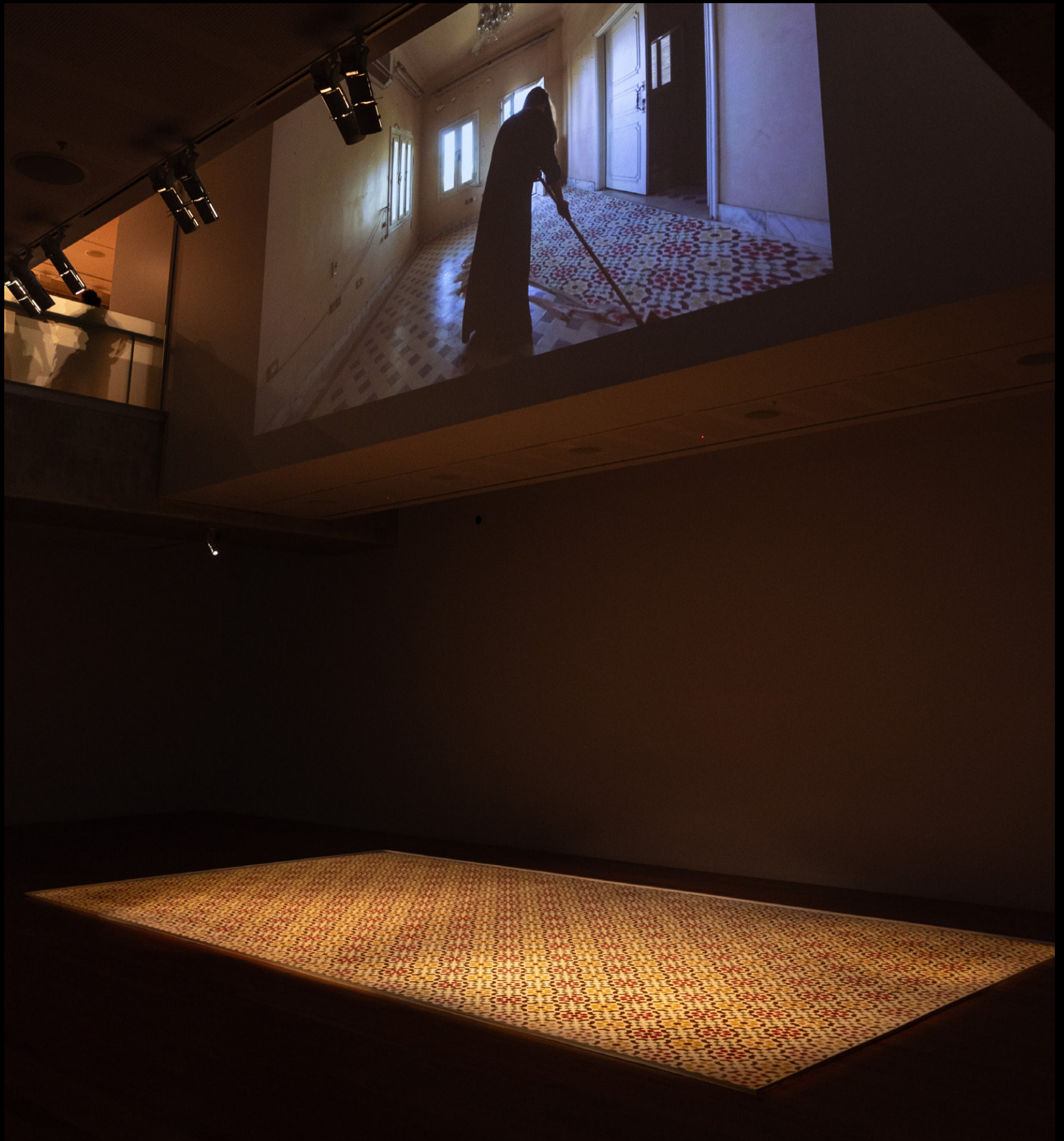
Dana AWARTANI, I Went Away and Forgot You. A While Ago I Remembered. I Remembered I'd Forgotten You. I Was Dreaming , 2017, installation view, Samstag Museum of Art, 2024 Adelaide Festival.