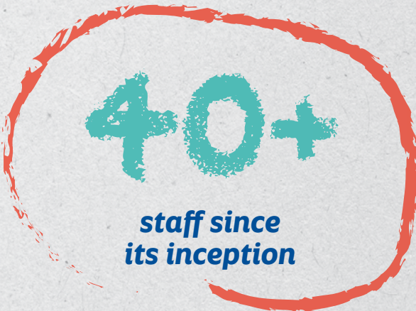
staff since its inception