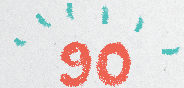
non-government, philanthropic and academic partners