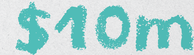
establishment grant from the Australian Government