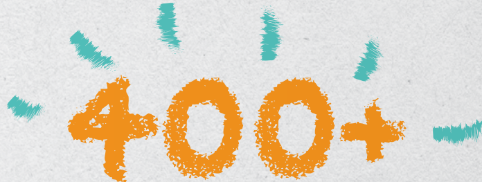
publications and presentations