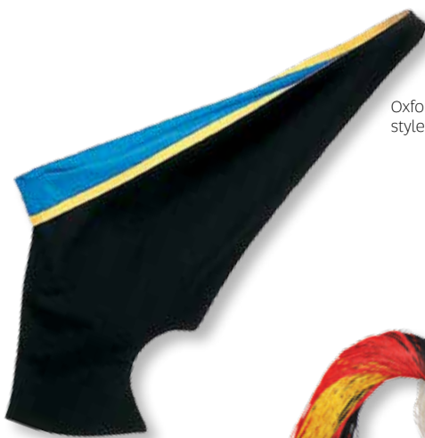
Oxford burgon style hood

The University of South Australia is no exception. In 1991, the University acknowledged the academic dress of its predecessor institutions and then in February 1992, the University's academic dress was determined by the Council and the first graduation ceremonies wearing the new University of South Australia academic dress occurred during April 1992. It is interesting to note that the hood chosen is of Oxford Burgon style while the gown is of the Cambridge style, an interesting link with two of the greatest European universities of the Middle Ages.