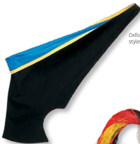
Oxford burgon style hood

The University of South Australia is no exception. In 1991, the University acknowledged the academic dress of its predecessor institutions and then in February 1992, the University's academic dress was determined by the Council and the first graduation ceremonies wearing the new University of South Australia academic dress occurred during April 1992. It is interesting to note that the hood chosen is of Oxford Burgon style while the gown is of the Cambridge style, an interesting link with two of the greatest European universities of the Middle Ages.