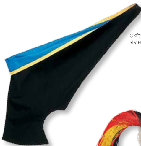
Oxford burgon style hood

The University of South Australia is no exception. In 1991, the University acknowledged the academic dress of its predecessor institutions and then in February 1992, the University's academic dress was determined by the Council and the first graduation ceremonies wearing the new University of South Australia academic dress occurred during April 1992. It is interesting to note that the hood chosen is of Oxford Burgon style while the gown is of the Cambridge style, an interesting link with two of the greatest European universities of the Middle Ages.