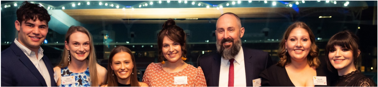
UniSA Human Resource Management Club Executive