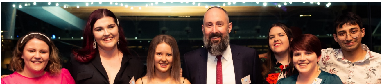
UniSA Tourism & Event Management Club Executive

If you are interested in connecting with any of our clubs directly to discuss collaboration let me know.