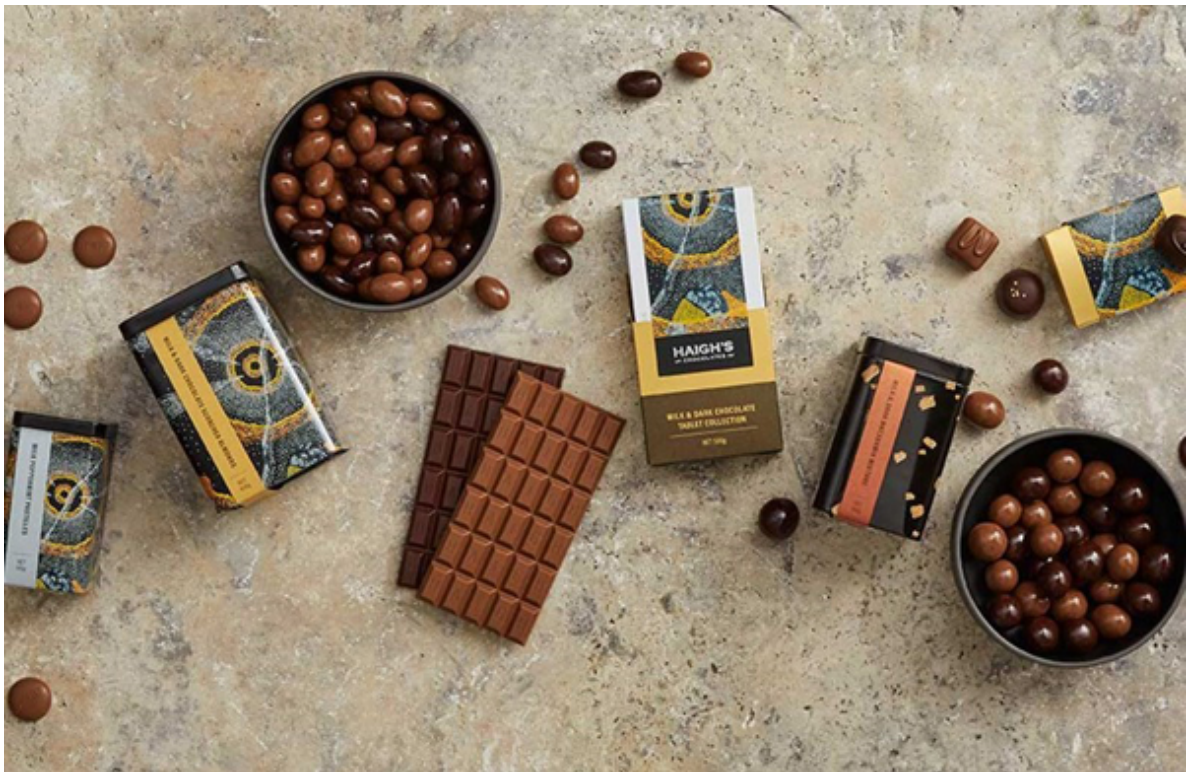
Haigh's Chocolates' Shooting Star Gift Range

A key difference to the core scholarship program is the opportunity for recipients to benefit from in-kind assistance offered by Haigh's Chocolates. This could be mentoring or work placement opportunities, as determined by Haigh's and recipients on a case-by-case basis.