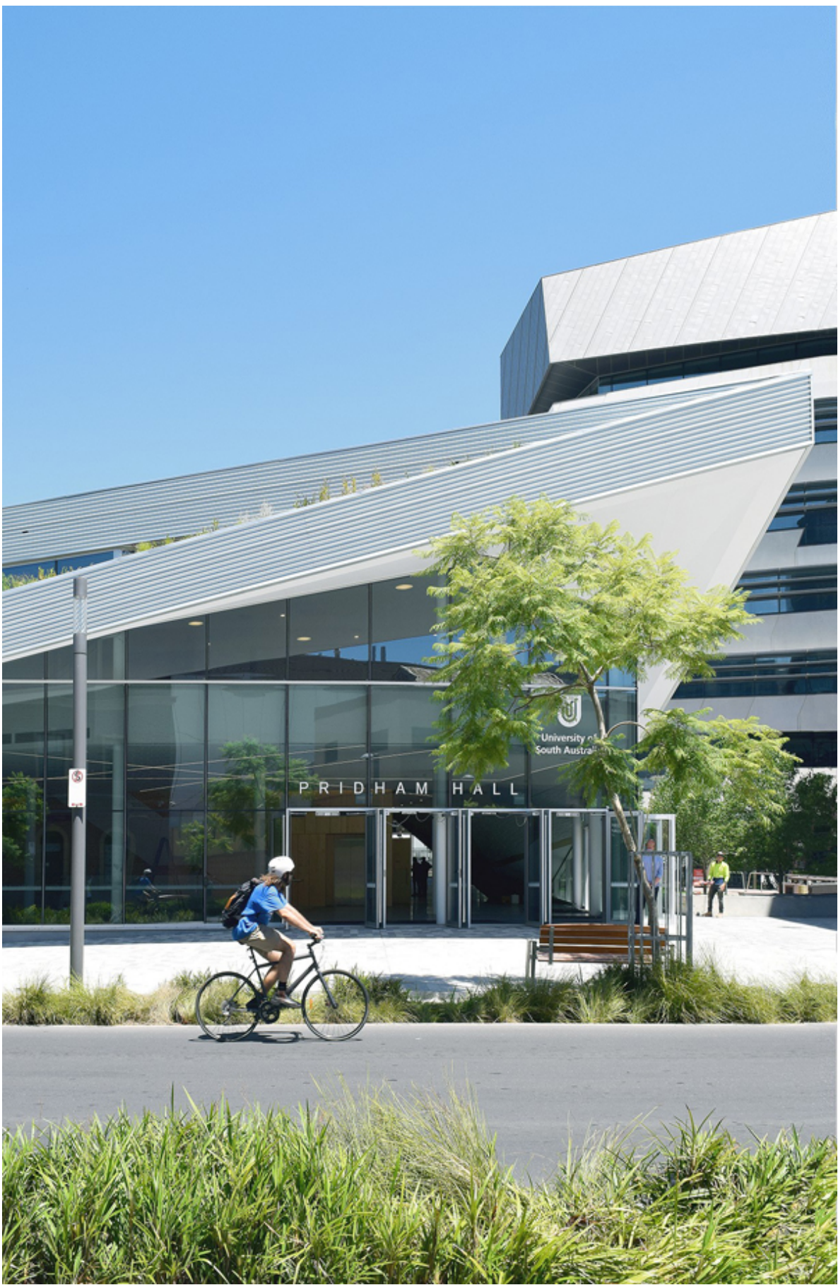
Pridham Hall, City West Campus by JPE Design Studio and Snohetta

"My first opportunity came from JPE, where I was lucky enough to work with Snohetta on the University of South Australia Pridham Hall project. I was supposed to be there for two weeks, but apparently did and said the right things, as I ended up staying around for another two months," he says.