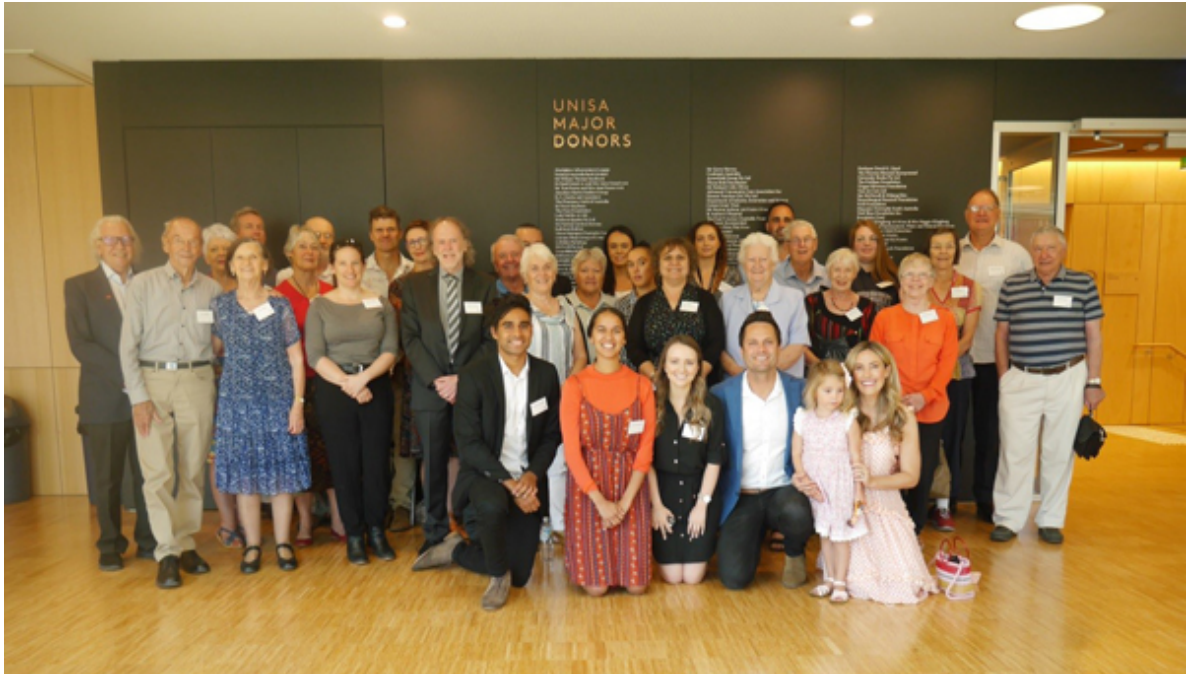
UniSA's Gavin Wanganeen Aboriginal and Torres Strait Islander Scholarship 2019 event where donors and recipients joined Gavin and his family.

"Haigh's is very pleased to collaborate with Gavin and delighted to see his striking artwork on our new gift range."