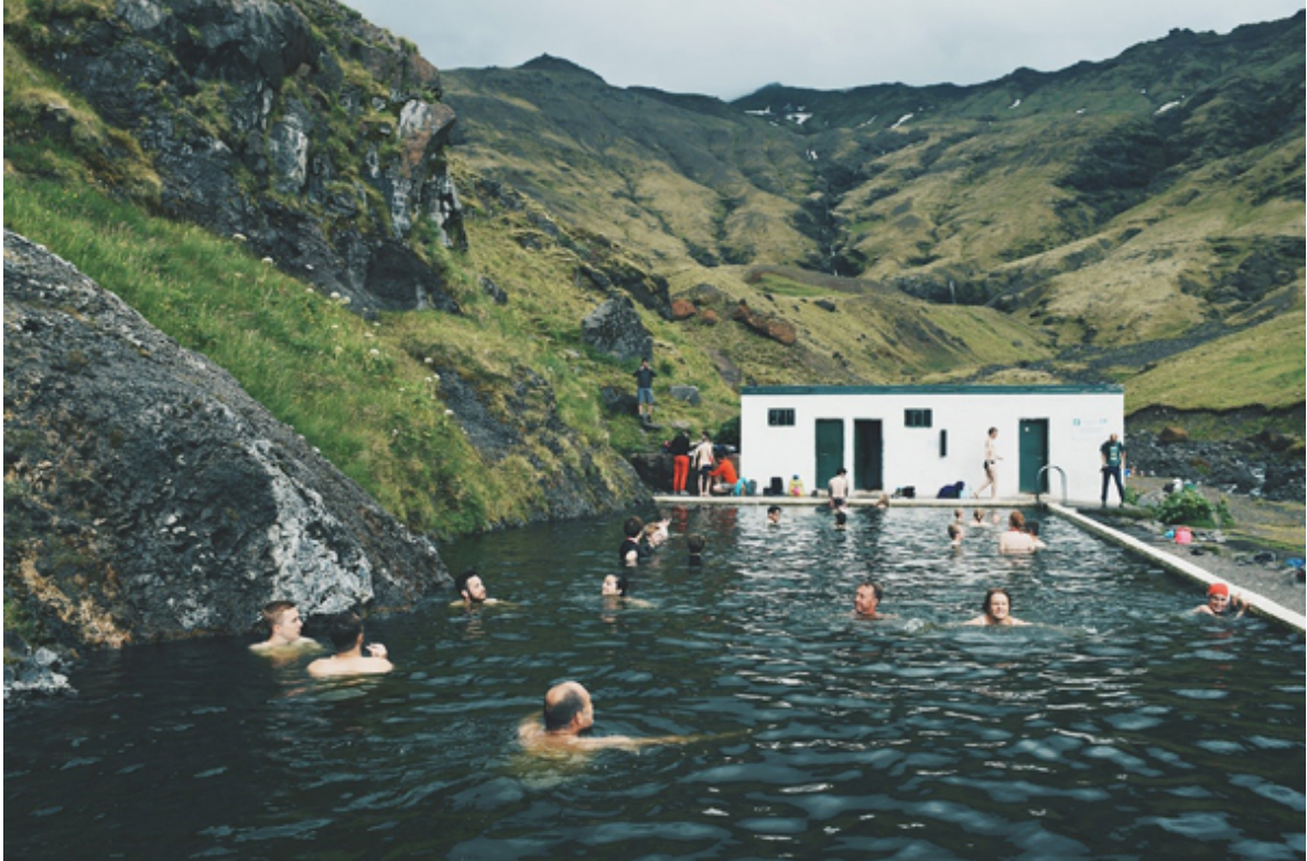
Sejavallalaug Pool, Iceland, taken during travel with the Jack Hobbs McConnell Traveling Fellowship

"More than anything it reaffirmed and reinforced my direction and aspirations at a seminal time in my emerging career. I spent some days with the Oslo office, which brought into perspective the opportunities that Snohetta has to offer."