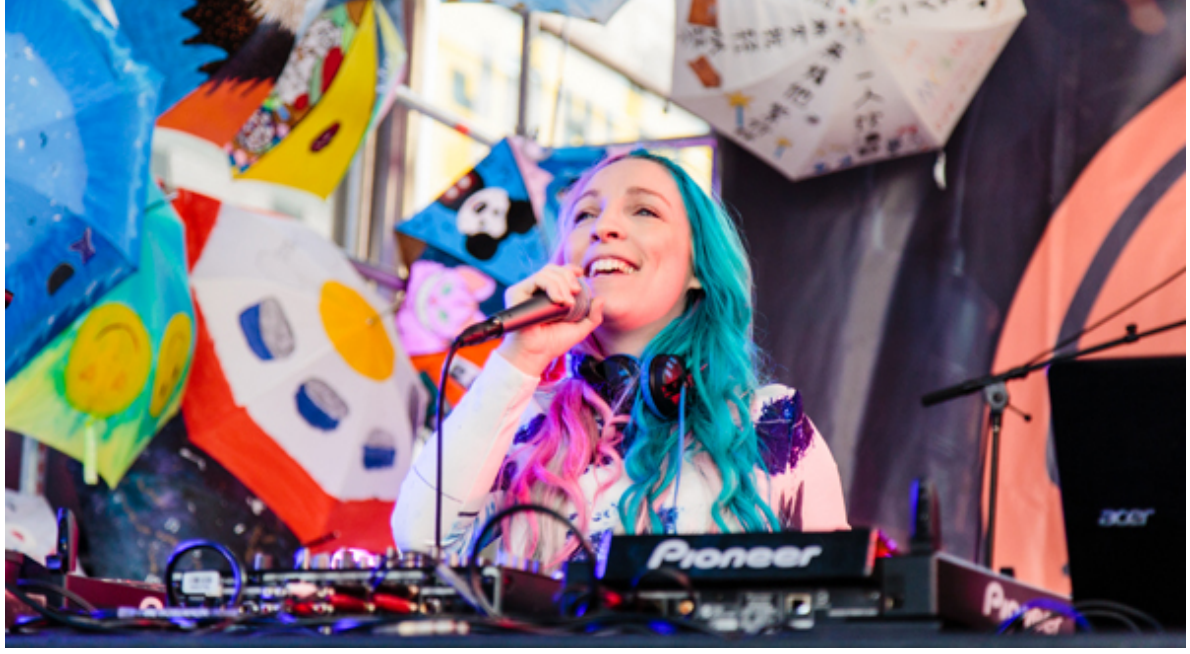
Umbrella: Winter City Sounds

"Walking away from a decent salary to work in the arts just as I was starting a family was a huge risk though. The risk paid off because I find it so rewarding, plus I have an incredibly supportive husband. When I ended up as General Manager at Music SA I figured all my experience had come together in the perfect role."