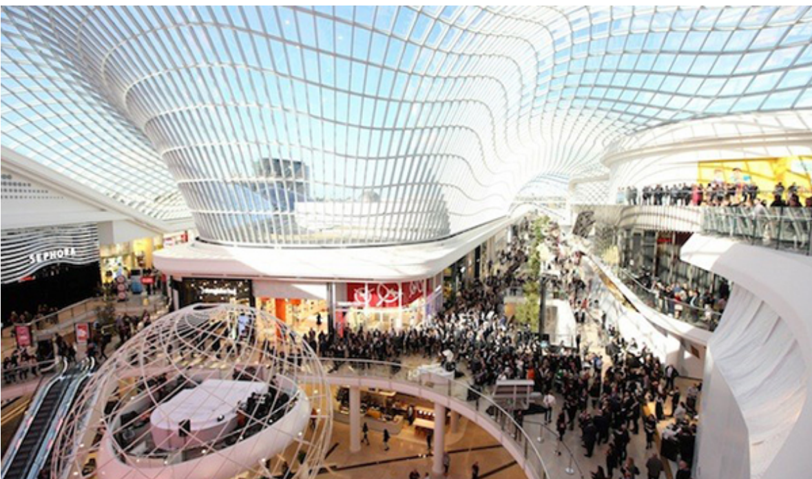
Image: The 2016 $600M Chadstone Shopping Centre development in South-Eastern Melbourne