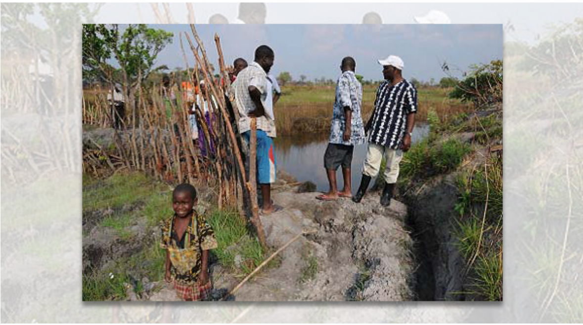
Image: Irrigation furrow is clogged during night time, so that water is stored in the pond formed with the weir. With the stored water, farmers could extend irrigation to more farmlands.

With access to basic sanitation barely improving since 2000 (when it stood at 26%), and basic water coverage in Zambia in 2015 standing at just 61% (86% in urban areas and 44% in rural areas), time is critical in this developing area in the world.