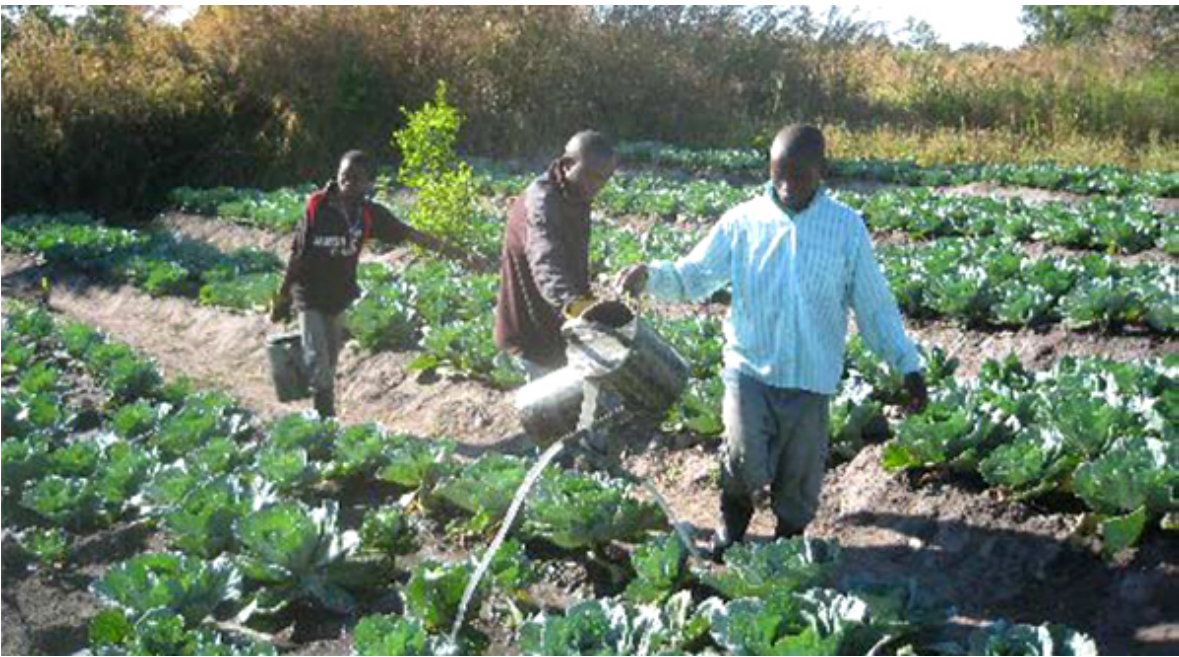
Image: Cabbage production is a part of major farming among the youth utilising water

“The Government of Zambia is currently rolling out poverty reduction but sustainable projects through diversification programmes, and the Ministry of Agriculture is implementing programs through irrigation development.”