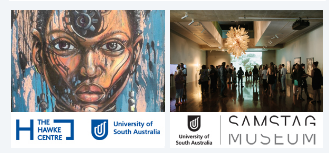
Your alumni network | Alumni Giving | Postgraduate Study | Alumni in the news | Contact us

>>Stay Connected The best way to reap the benefits of being an Alumnus of the University of South Australia is to keep us up to date with your changes of address or workplace.