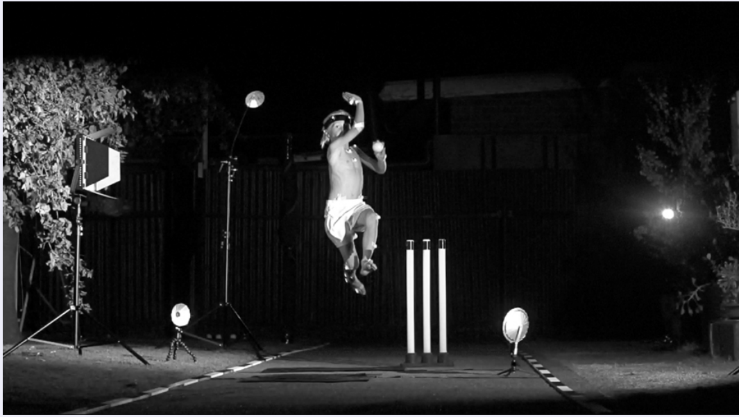
Trent PARKE and Narelle AUTIO, The Summation of Force (still from digital moving image), 2017.

The Summation of Force will be on display at the Samstag Museum from Friday 30 June to Friday 1 September.