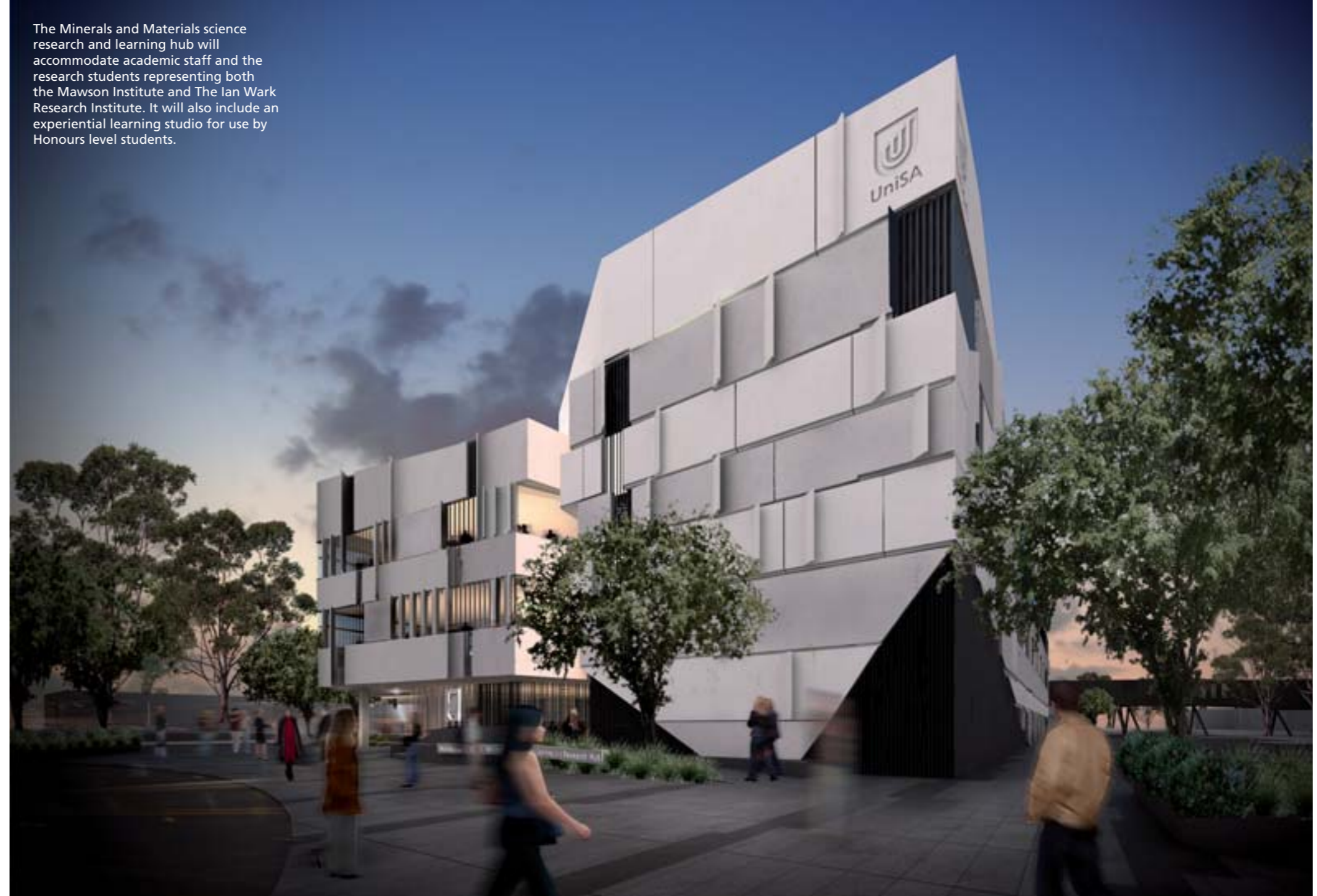
The Minerals and Materials science research and learning hub will accommodate academic staff and the research students representing both the Mawson Institute and The Ian Wark Research Institute. It will also include an experiential learning studio for use by Honours level students.