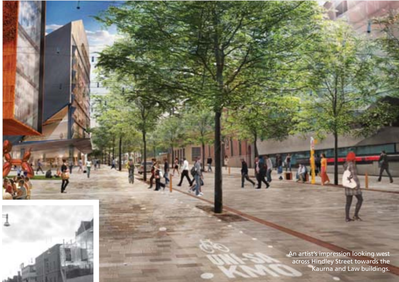
An artist's impression looking west across Hindley Street towards the Kaurua and Law buildings.