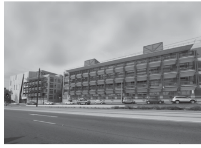
The northern edge of City West campus with new North Terrace frontage.