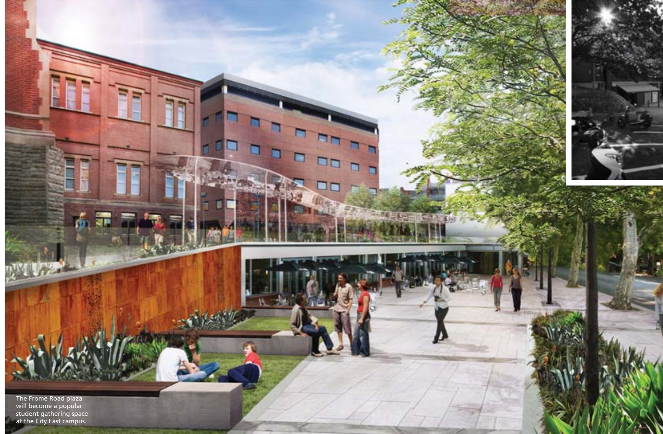
The Frome Road plaza will become a popular student gathering space at the City East campus.

The plans propose that the City East campus will reinforce UniSA's green credentials and will feature new plantings, lighting and outdoor seating. Frome Road will become a more pedestrian-friendly boulevard and, with the upgrade of the Reid Common into a spectacular green space, the Reid Building, home to the University's Sansom Institute, will finally be integrated with the main campus.