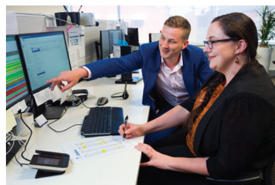
UniSA Online's student support team in action.