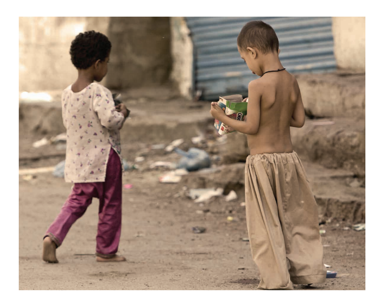
Page 20 | Cultural Diversity & Child Protection, Kaur, J (2012)