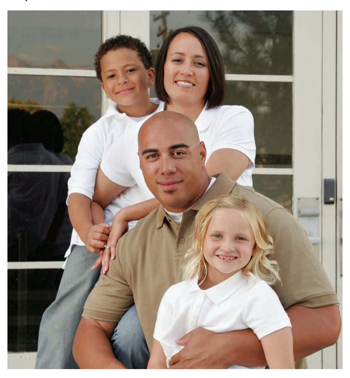
Page 10 | Cultural Diversity & Child Protection, Kaur, J (2012)

Professionals working with CALD or refugee communities need to understand the diversity and cultural differences in child rearing practices. This was first explored by Karamoa et al who provide a framework to distinguish between those 'traditions that can cause harm (e.g. female genital mutilation) and ones which can positively enhance the child's cultural identity (e.g. breast feeding and showing respect)' (p415). The following Table 1. outlines examples of diverse child rearing practices within CALD and refugee communities. These examples are drawn from the research literature and highlight the different professional interpretation that can occur within CPS.