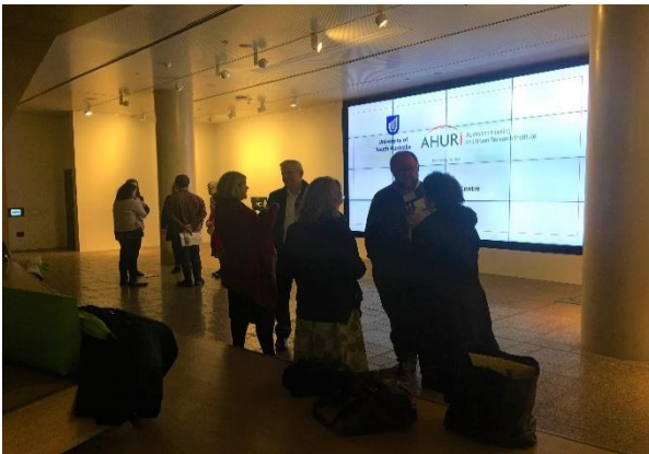
UniSA AHURI Research Centre Networking Event.

The Research Centre's annual networking event was once again held in the Jeffrey Smart Forum at City West.