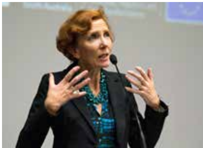
Baroness Janet Royall