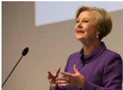
Prof. Gillian Triggs