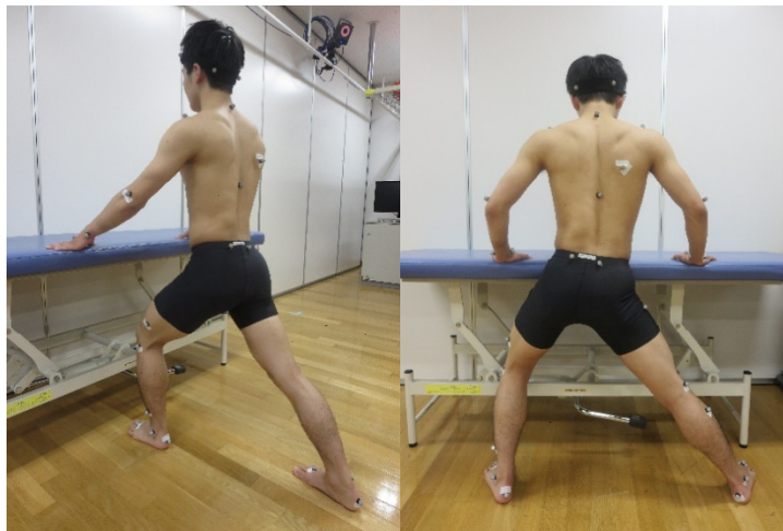
Fig 4. Two types of hip stretching; stretching for hip flexors (left) and stretching for hip adductors (right).

Top view (up) and side view (down). Participants set their left foot on the mark line on the mound (painted in grey) in the set position, and threw a ball towards the radar gun behind the pitching net (painted in mesh pattern).