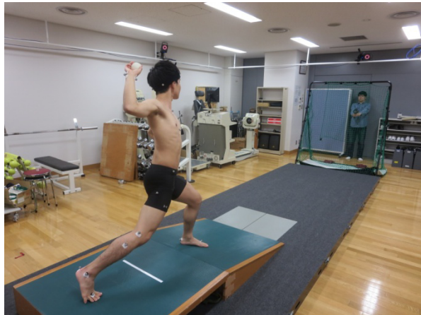
Fig 2. Assessment of the pitching task using VICON and radar gun

non-reflective firm-fitting elastic short pants. Motion data were collected for a total of 10 fastball pitches. Mean values of maximum hip abduction ROM on both sides and hip extension ROM on the trail side were calculated.