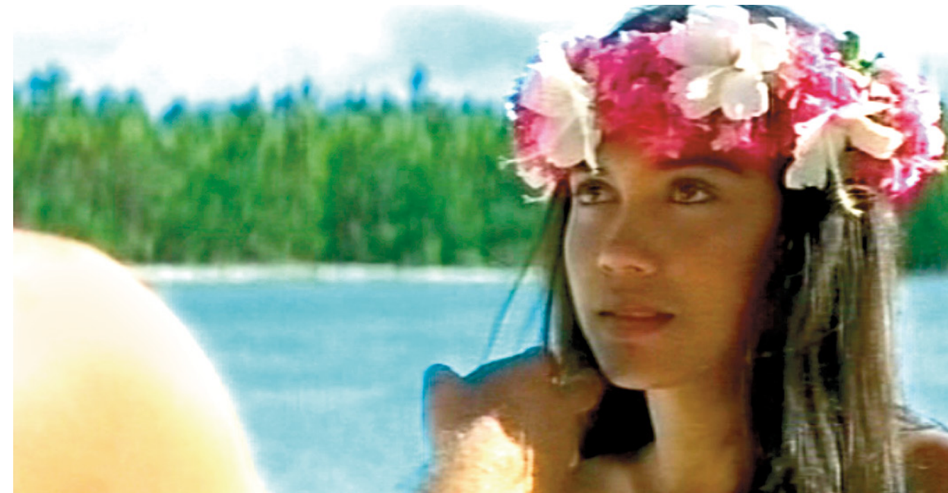
Image: Tracey MOFFATT & Gary HILLBERG, Other (still), 2010, looped video with sound, duration 7 minutes. Courtesy the artist, Roslyn Oxley9 Gallery, Sydney, and Tyler Rollins Fine Art, New York.

Montages was curated and developed by Artspace, Sydney, and is touring nationally in partnership with Museums & Galleries of NSW.