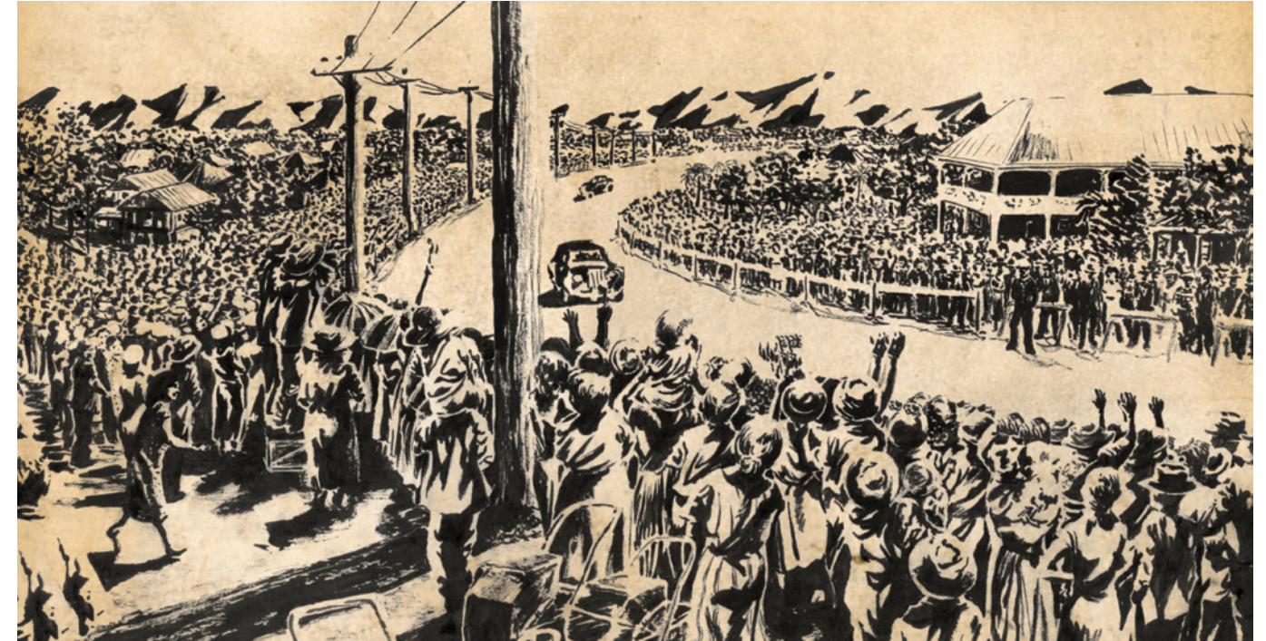
Image: Douglas WATKIN, The Queen & I (detail), 2011, single-channel HD 16:9 colour animation with sound, duration 10 minutes. Gift of the artist through the Art Gallery of South Australia Contemporary Collectors 2014. Donated through the Australian Government's Cultural Gifts Program, Art Gallery of South Australia, Adelaide.

Bookings for the Vernissage are not necessary, but please arrive early to avoid disappointment. For full program details, please visit adelaidebiennial.com.au .