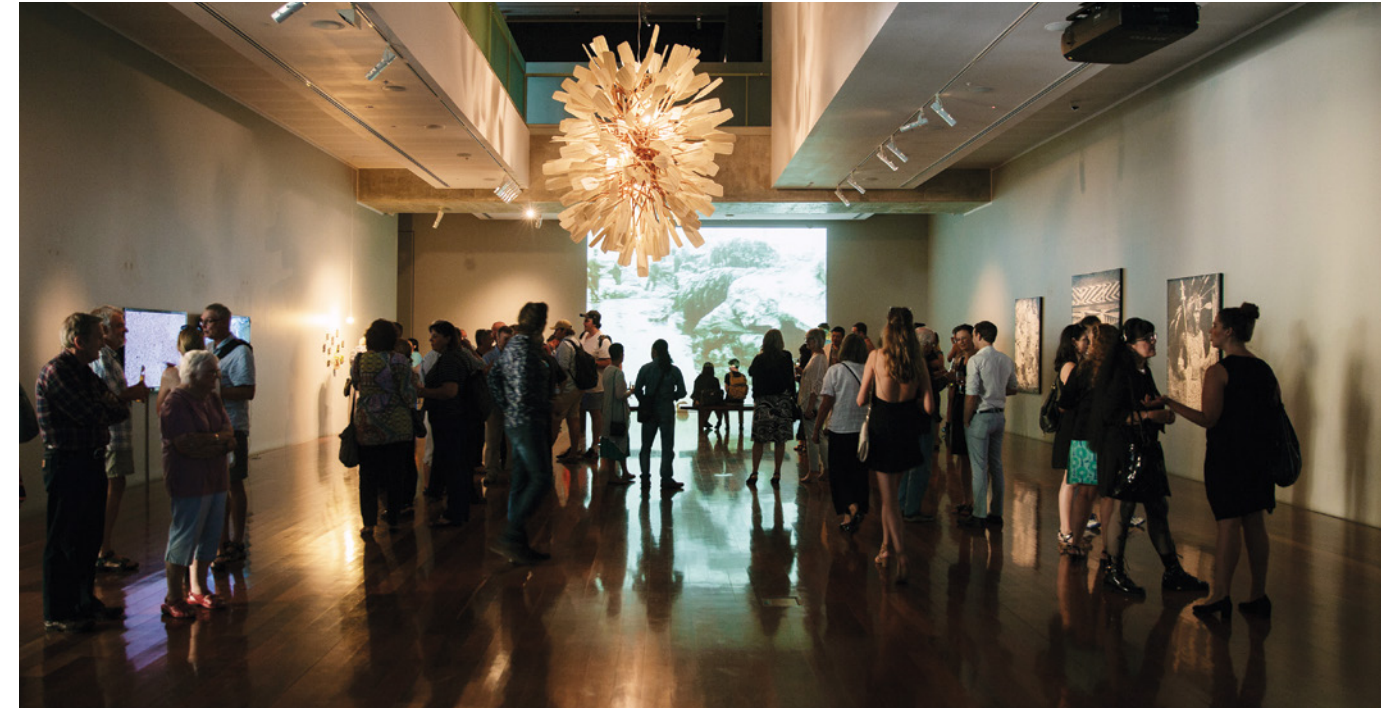
Image: Anne & Gordon Samstag Museum of Art, Countercurrents , March 2017.

On selected evenings from 5pm, Adelaide's West End arts precinct comes alive! Head west for a lively program of exhibitions, film screenings, music, workshops, talks, dance, theatre, food and drink. For event and venue details, please visit artafterdarkwestend.com .