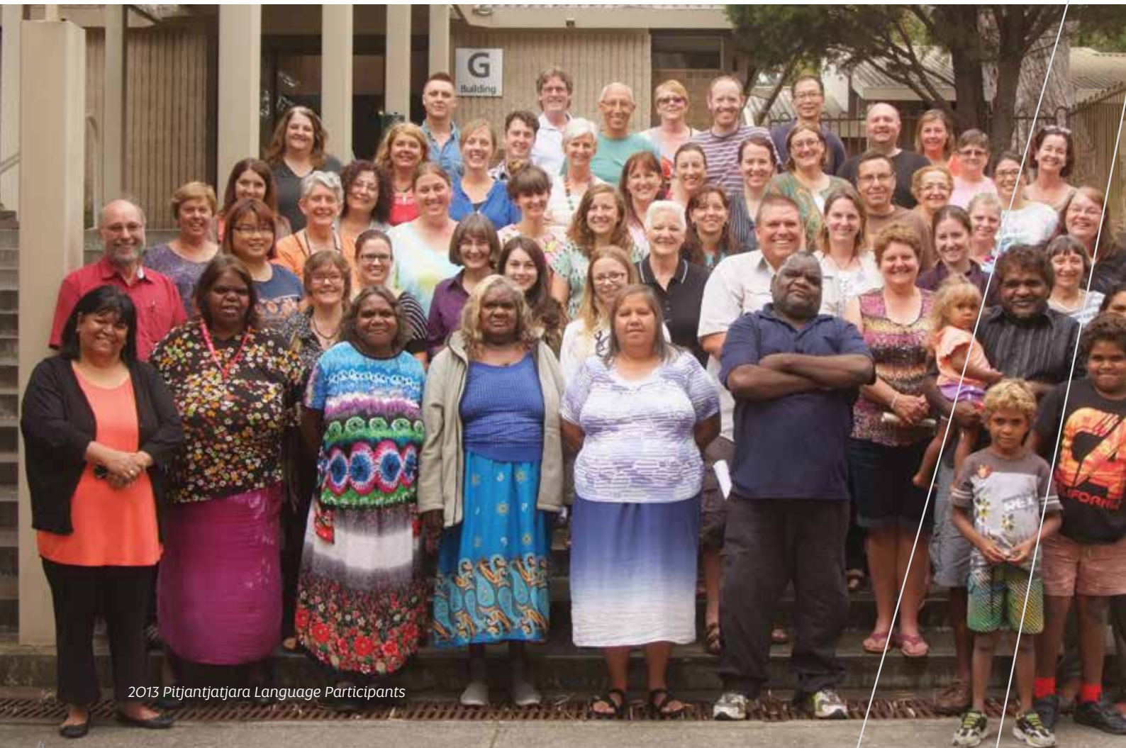
2013 Pitjantjatjara Language Participants

DUCIER plays a central role in supporting the University of South Australia's commitment to Indigenous education and reconciliation. We have a particularly valuable contribution to make to the process of reconciliation by educating the Australian community about the cultures, languages, history and contemporary experiences of Australia's Indigenous peoples.