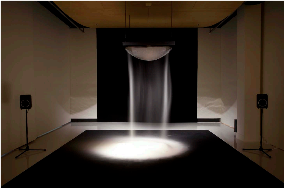
Sarah DUYSHART, Sift , 2013, installation view, mixed media, dimensions variable, courtesy the artist