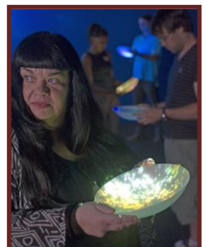
Hold: Vessel 1 & 2 (2001-07)