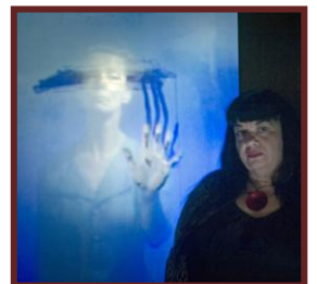
Evolution of Fearlessness (2006)