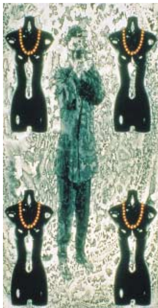
Rea EYE/I MMABLAKPIECE 1996 cibachrome print 165 x 80

directions and describe two different feelings: “nice” and “nigger”, “mum” and “gin”. These new composite words are familiar yet strange. They resonate poetically and the formal play of the shapes of the yellow letters outlined in white against a black background holds our attention while we struggle with recognition, and ponder meaning.