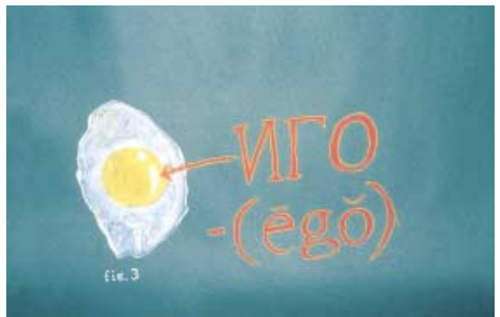
Archie MOORE Yolk 1998 pastel on card 40 x 30

Growing up Aboriginal in a country town in rural Queensland, Archie Moore found words sometimes like a cut or a slap. In the jokey meanness of the playground, racist taunts came in forms that could be simultaneously hurtful and funny, depending on where you stood. This experience spurred an interest in language, as a structural system, and as a form of communication dependent for its sense on cultural context and values.