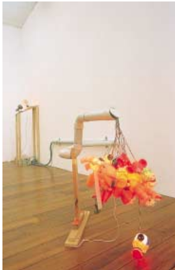
Paul WHITE Spin again/plastic reality 1999 detail of installation Detour variable dimensions

Paul White uses everyday materials in his sculptural installations. Some objects are purchased, but the majority are found. A bric-a-brac of society's detritus – old plastic toys, blankets, lino – the abandoned, leftover and waste are re-cycled in his work, with a strong formal aesthetic sense governing this reinvestment.