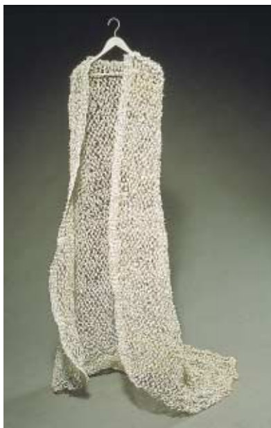
Christine COLLINS White Lies 1998 plastic soldiers, wire 250 x 150

Collins uses textile-like processes: repeated elements are linked together, setting up a relationship between the overall image and underlying pattern. Made out of electronic resistors hooked together, the chain-mail fabric of Dress turns down the volume of heavily didactic political comment in preference for a pun: electronic code/social code. This work indulges a sensual interaction between materials and the implied corporeal form of the body. The shimmering veil of Dress conjures the sensuality of material moving over form, the interaction of texture and shape.