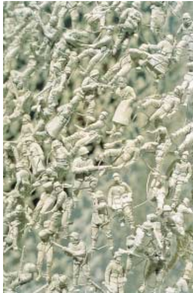
Christine COLLINS White Lies (detail) 1998 plastic soldiers, wire 250 x 150

collective project which is monitored by some idea of verifiability? What stands in the visual arts as ‘an original contribution to knowledge’? What is the difference – a distinction we may want to hold on to – between the practising artist and the academic researcher? Is research an appropriate term for the type of activity artists engage in?