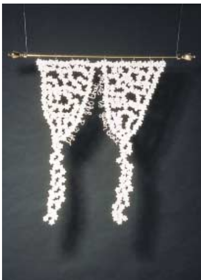
Glenys HODGEMAN Curtain 2000 glued quilled paper death shrouds, brass rings, brass curtain rod 150 x 150

organ donation – often referred to as 'the gift of life' – provoked an interest in the broader notion of gift-giving in social practice, the economy of the relationship, its forms and meanings. Through both her experience and research Hodgeman concludes that a gift is not, as commonly thought, a gratuitous legacy, but a complex system of mutual obligations, very much part of the fabric of social bonding.