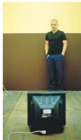
John SPITERI Police Line-up 1999 installation of video, acrylic paint on wall 165 x 80