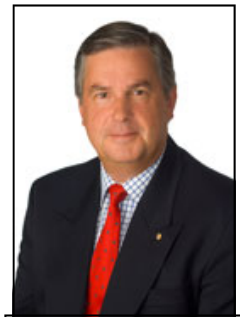
SA Governor H.E. Rear Admiral Kevin Scarce AO CSC RANR

We have since welcomed 10 GLF Fellows into our MBA, and another 2 will be starting in January 2008.