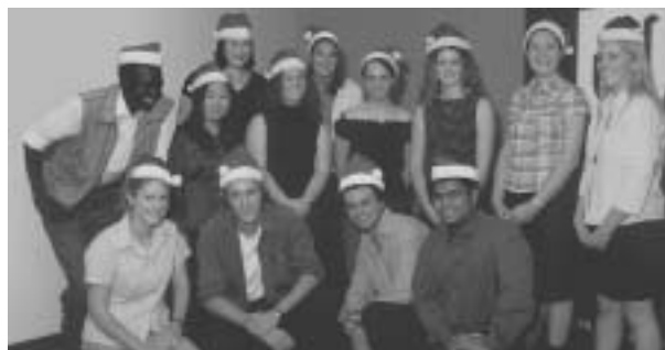
Smith Family Transition Grant Winners 2002

$10,200 was donated to the Sansom Trust by two donors in 2002.