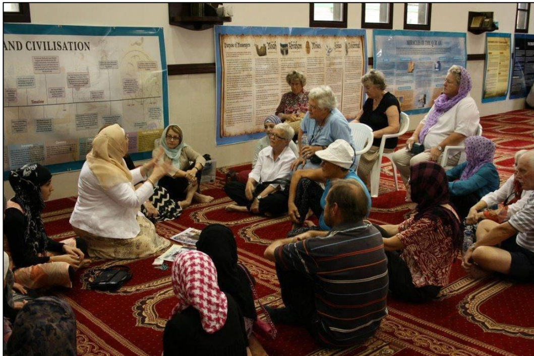
An information session at the Adelaide Mosque Open Day in 2015