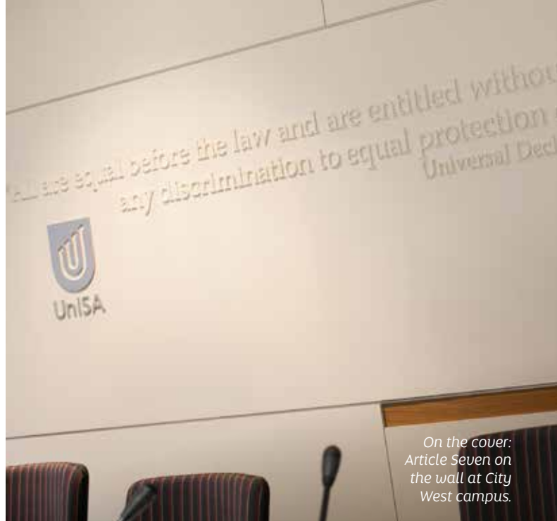
On the cover: Article Seven on the wall at City West campus.

Find out more about the University's commitment to reconciliation at unisa.edu.au/RAP