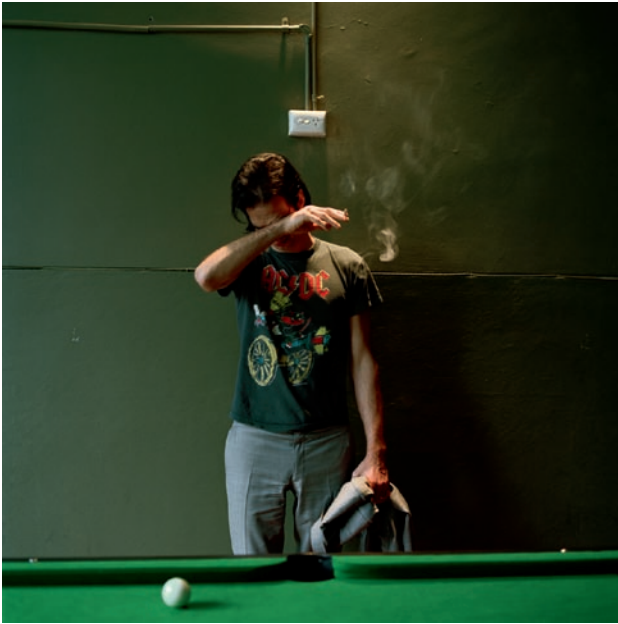
Ingvar KENNE, Nick Cave , 2001, chromogenic print, 100 x 100 cm, courtesy of the artist