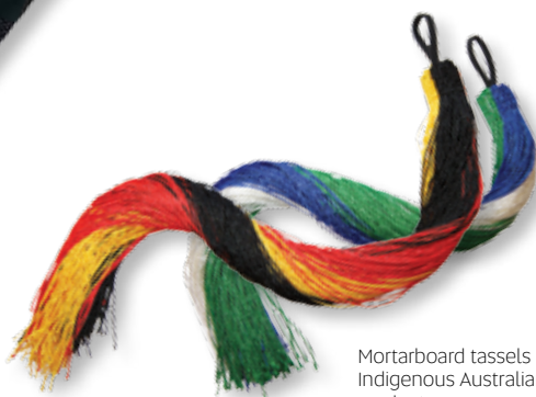
Mortarboard tassels for Indigenous Australian graduates