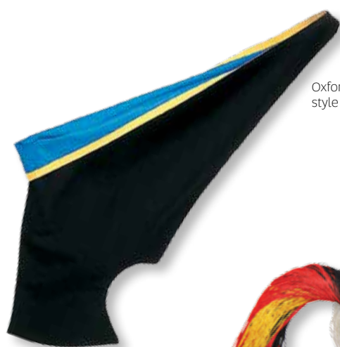
Oxford burgon style hood

The University of South Australia is no exception. In 1991, the University acknowledged the academic dress of its predecessor institutions and then in February 1992, the University's academic dress was determined by the Council and the first graduation ceremonies wearing the new University of South Australia academic dress occurred during April 1992. It is interesting to note that the hood chosen is of Oxford Burgon style while the gown is of the Cambridge style, an interesting link with two of the greatest European universities of the Middle Ages.